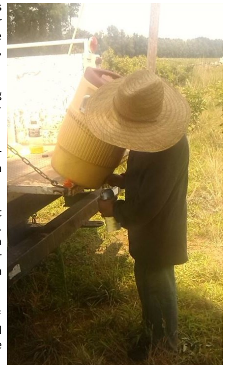
A child worker getting water.

At Kinston Community Health Center, non-judgmental attitudes are a requirement. Many of our outreach workers have some experience with agricultural work. We understand the social determinants that can lead to the need for children to work in agriculture. Our efforts ensure all children receive appropriate care.