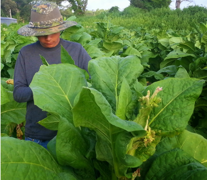
A child working in a tobacco field.